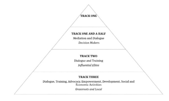
Figure 1, Visual of "tracks," published in Jones, 2015

The introduction of this third track means that Track Two can become, if necessary, an important form of linkage between Track One and Track Three.<sup>10</sup> The notion of differentiations and possible linkages between the tracks was further conceptualized with the notion of Track 1.5, which describes activities in which unofficial actors work with official representatives of the conflict parties<sup>11</sup> in order to influence attitudinal changes between the parties. These new levels represent the broadening of the Track Two concept, and dovetails with the broadening notion of peace beyond the cessation of hostilities into something more sustainable, legitimate and effective. These new developments are presented visually by Jones (2015).